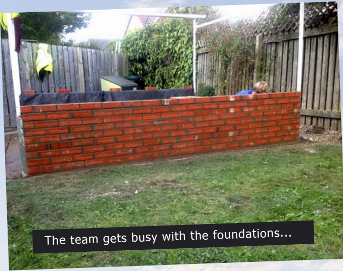
The team gets busy with the foundations...