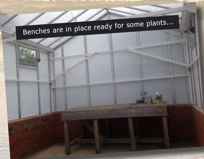
Benches are in place ready for some plants...