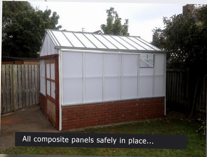
All composite panels safely in place...