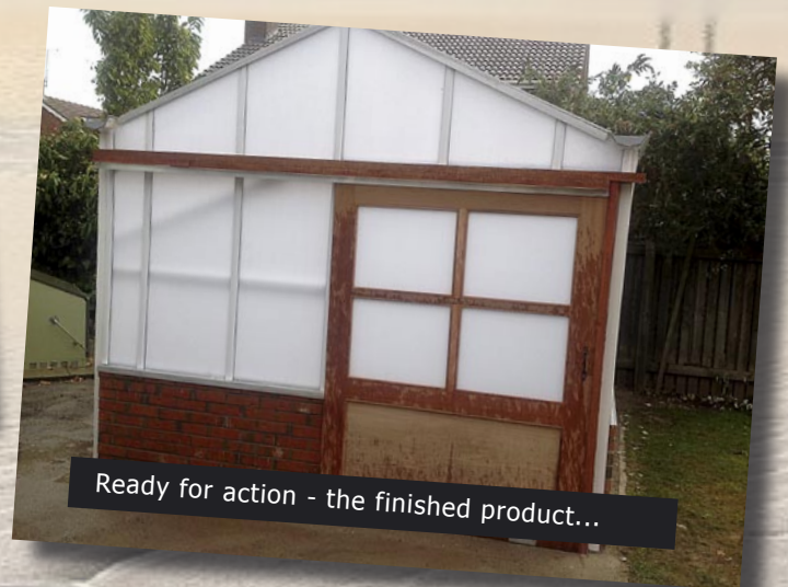
Ready for action - the finished product...