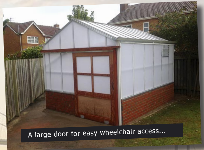
A large door for easy wheelchair access...