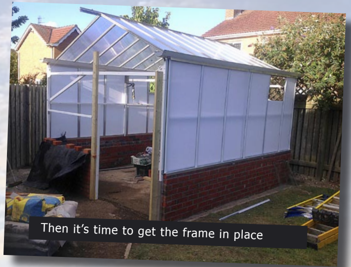
Then it's time to get the frame in place